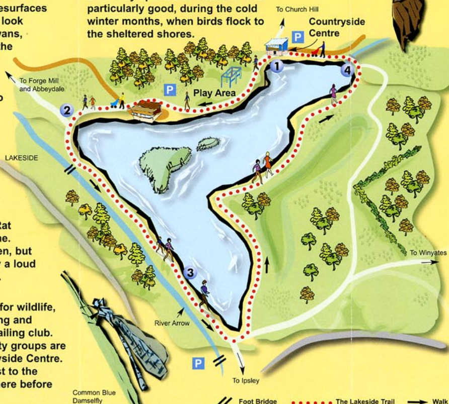
Common Blue Damselfly

Now why not return to the Countryside Centre for some well-earned refreshments!